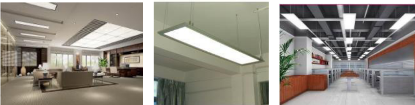
" WITQ B J GUBJOTVC PD W DB OF XU P W Q W D F